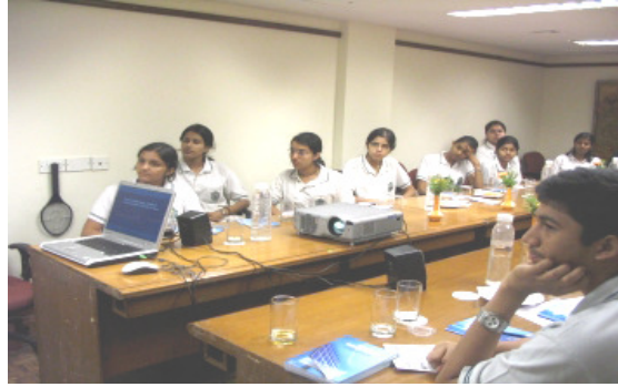
Students from Delhi Public School keenly observing the presentation made for them on Earth Day