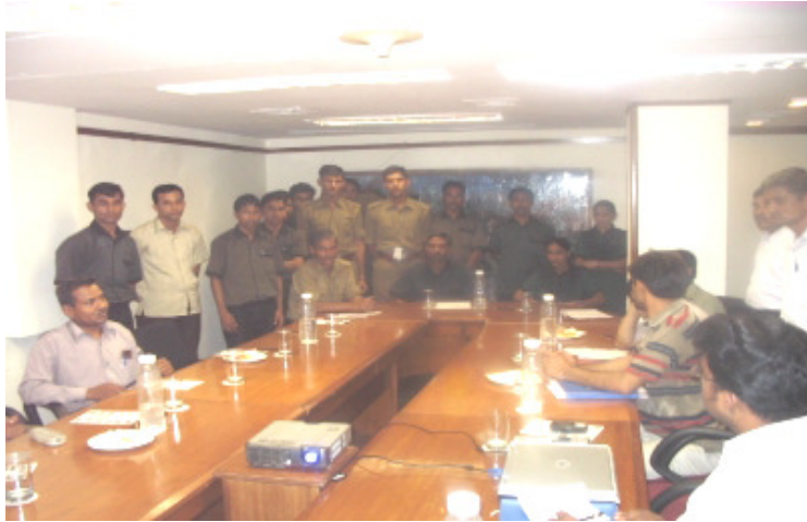
Training programme conducted for crewmembers

We also conduct regular training programs for vendors & suppliers to guide them about the policies and standards of PBC™-STIP