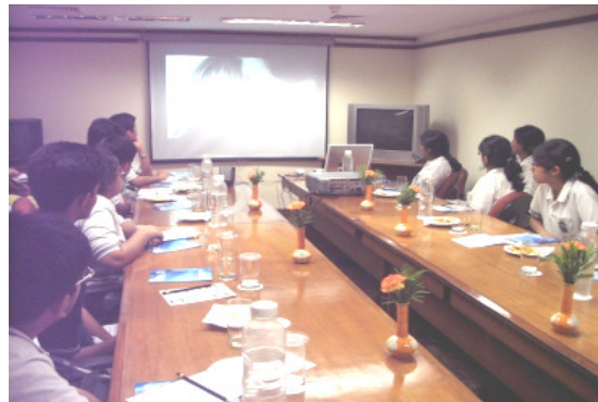
Students watching Al Gore's "An Inconvenient Truth" a stirring documentary focusing on Global Warming