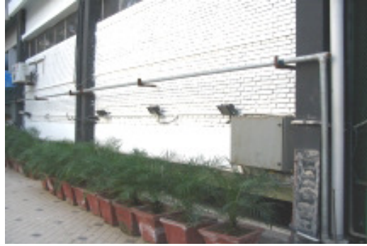
Soap free water pipeline going to the garden