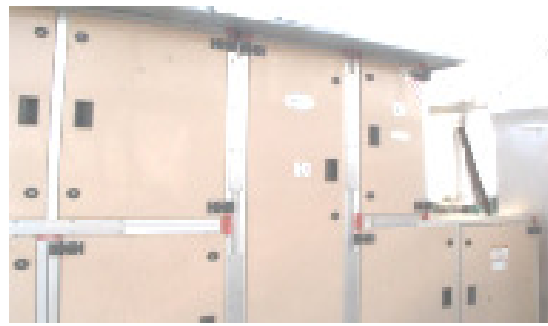
Heat Recovery Wheel

HRW is basically, used for exchanging the heat from the incoming air sucked from the ambient to the outgoing air from the building, while the coolness of the outgoing air is transferred to the incoming fresh air.