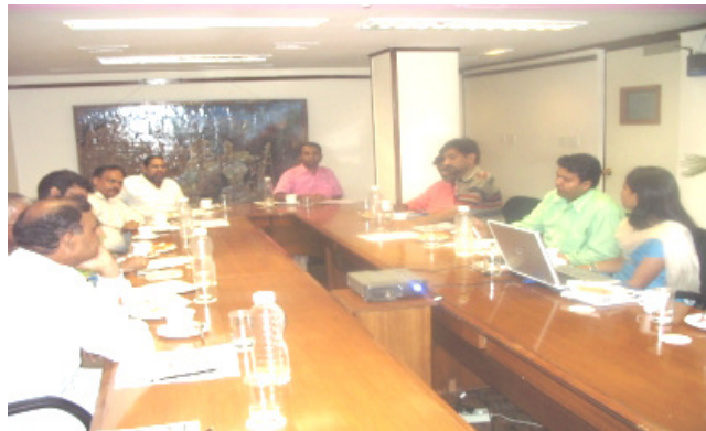
Training programme for vendors & suppliers

We also conduct regular training programs for vendors & suppliers to guide them about the policies and standards of PBC™-STIP